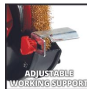
ADJUSTABLE WORKING SUPPORT