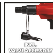
INCL. VALVE ACCESSORY