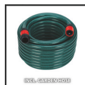
INCL. GARDEN HOSE