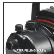
WATER FILLING SCREW