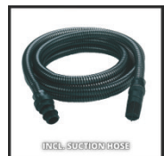
INCL. SUCTION HOSE