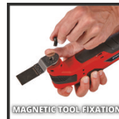
MAGNETIC TOOL FIXATION