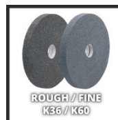
ROUGH / FINE K36 / K60