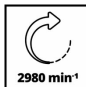
2980 min -1