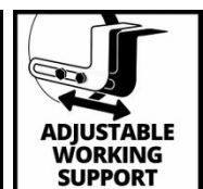
ADJUSTABLE WORKING SUPPORT