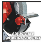
ADJUSTABLE WORKING SUPPORT