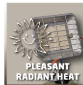
PLEASANT RADIANT HEAT