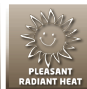
PLEASANT RADIANT HEAT