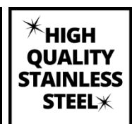
HIGH QUALITY STAINLESS STEEL