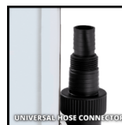
UNIVERSAL HOSE CONNECTOR