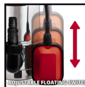
ADJUSTABLE FLOATING SWITCH