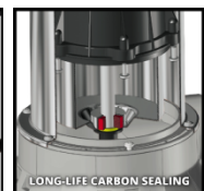
LONG-LIFE CARBON SEALING