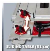
SLIDING TABLE (51 cm)