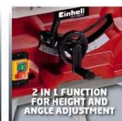
2 IN 1 FUNCTION FOR HEIGHT AND ANGLE ADJUSTMENT