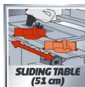
SLIDING TABLE (51 cm)