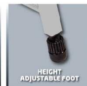
HEIGHT ADJUSTABLE FOOT