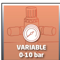
VARIABLE 0-10 bar