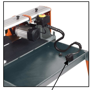
Water trough with integrated pump for cooling water vlagus