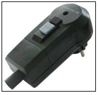
RCD plug for machine safety