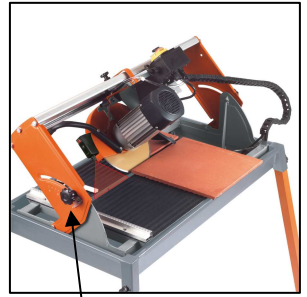
Infinitely swiveling motor guide from 0°-45°