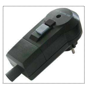
RCD-plug for machine safety