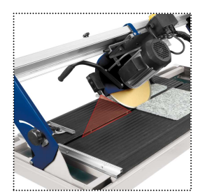
Infinitely swivelling motor guide from 0°45°